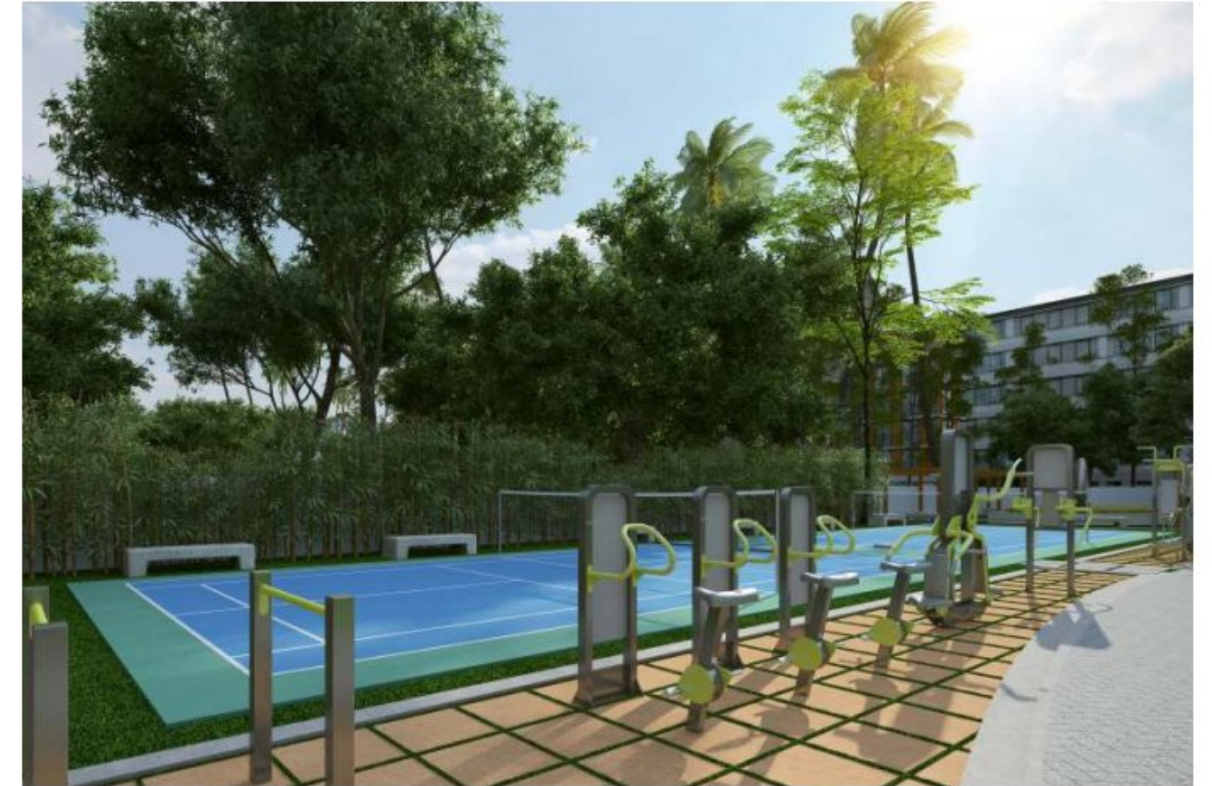
Tennis Court & Outdoor Gym