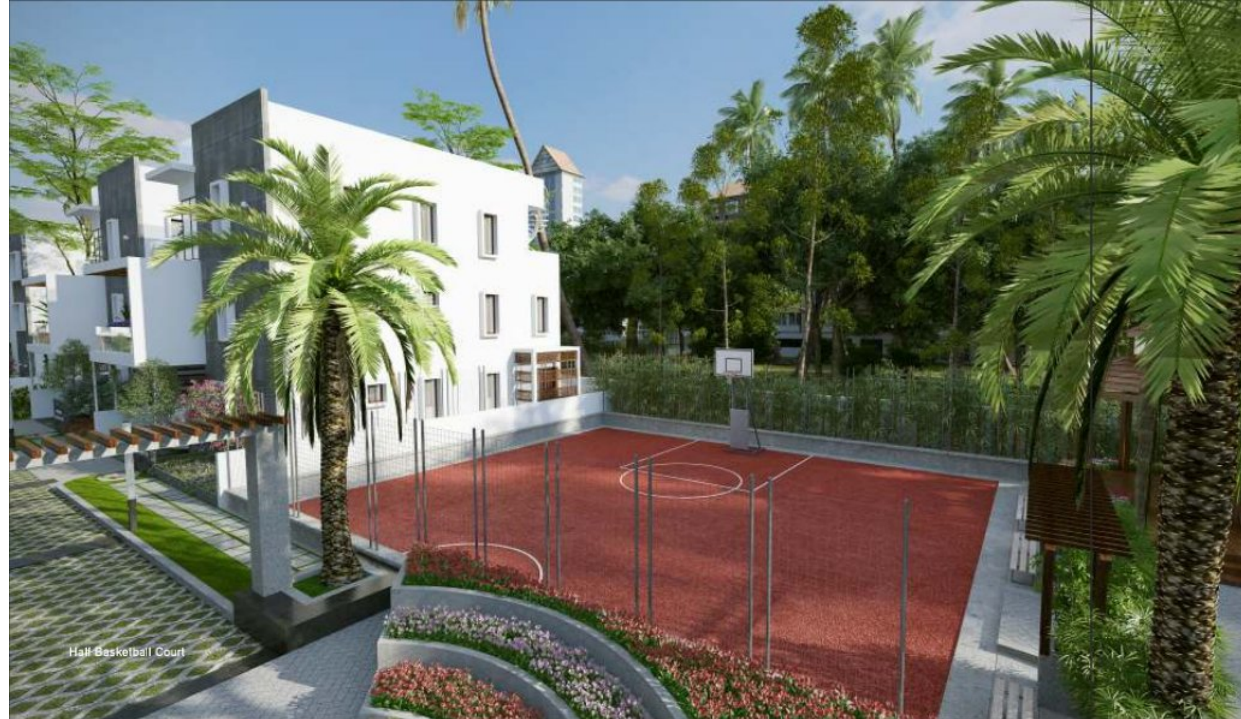
Half Basketball Court